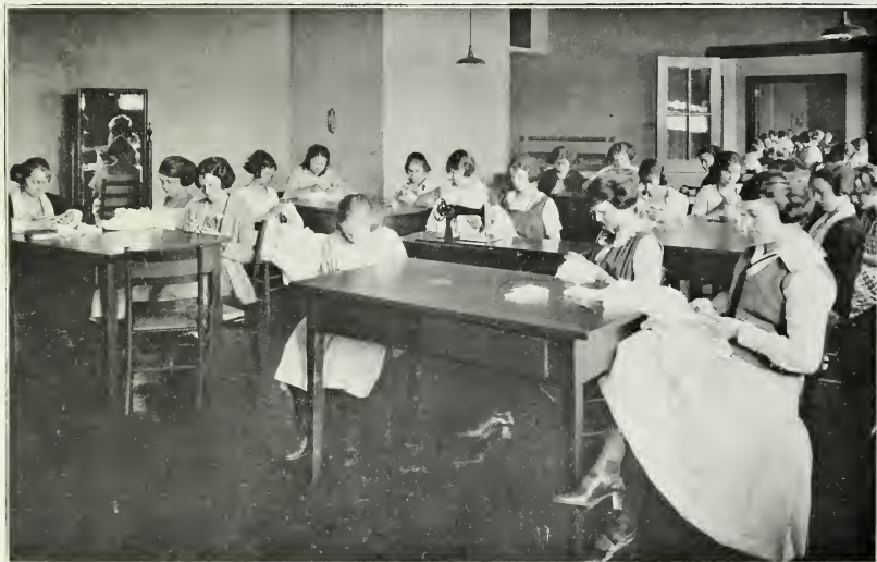
HOME ECONOMICS—FOR GREATER ECONOMY AND GREATER ARTISTRY IN AMERICAN HOMES Two-year course, leading to the diploma and the state certificate. Four-year course, leading to the B. S. degree and the state certificate.